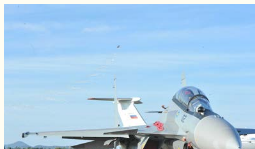
...See page 7

First Sukhoi SU-30 MKM overhauled in Malaysia was received by the Royal Malaysian Air Force (RMAF) on the inaugural day of the LIMA 2019.