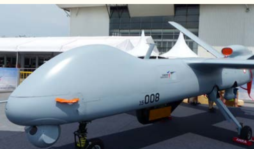
...See page 6

With Malaysia planning to acquire a sizeable number of unmanned aerial vehicles (UAVs), Turkish Aerospace Industries (TAI) is showcasing its Anka MALE UAV for the first time at LIMA 2019.