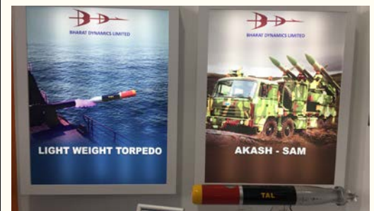
...See page 3

Indian state-owned defence firm Bharat Dynamics Limited (BDL) is promoting its two new torpedoes for the regional market at the ongoing LIMA.