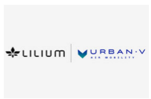
Lilium and UrbanV to Collaborate on Vertiports