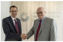
Collins Aerospace Signs MRO Agreement with Envoy Airlines