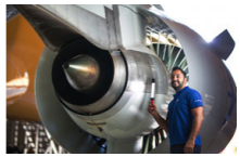
Embraer Launches the Next Generation of AHEAD Tool for Commercial and Executive Aviation