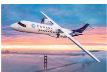
Air Cahana Signs Up for 250 Zero-Avia Hydrogen-electric Engines