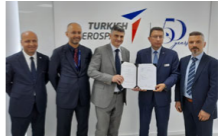
MA Group Inks Strategic Cooperation Deal with Turkish Aerospace, Industrial Partner TAAC