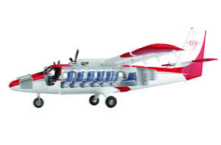
De Havilland Canada and Zimex to Purchase Two New DHC-6 Twin Otter Classic 300-G Aircraft