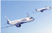
Airbus Flag Flies High in Paris, eVTOLS Come of Age