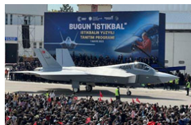
Great First Half of the Year for Turkish Defence Industry