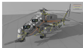
Aselsan Offers Future Avionic Suite Technology "AAS"