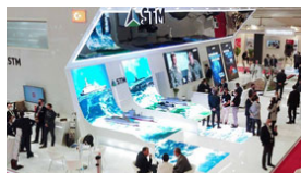
STM Showcases Naval Platforms and Tactical Mini-UAV Systems