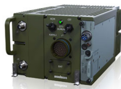
Aselsan Promoting IFF Mode 5/S Systems Portfolio