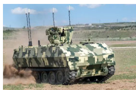
Operationally Ready Shadow Rider H-UGV on Display by FNSS